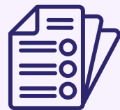
Student Resource Kit provided at each performance