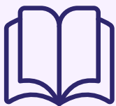
Syllabus Links HSC English and Drama

To learn more about ACA Company, click on the links below or submit an enquiry visit www.actorscentreaustralia.com.au/education